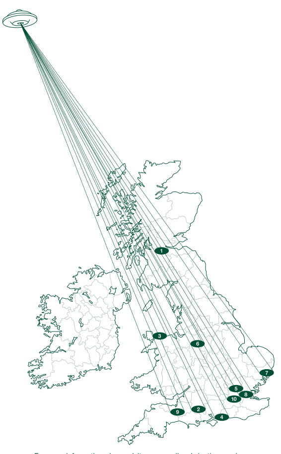
For more information please visit www.myalienabduction.co.uk